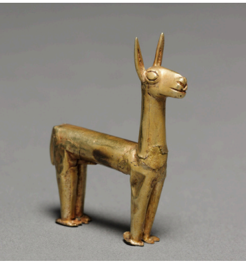
Llama Figurine. 1400–1532. The Cleveland Museum of Art.

“For researchers, keeping a record of your research is probably more important than anything else. Almost more important than what you say about the research, because if you can't track back your sources, you can't really use it, you know.”