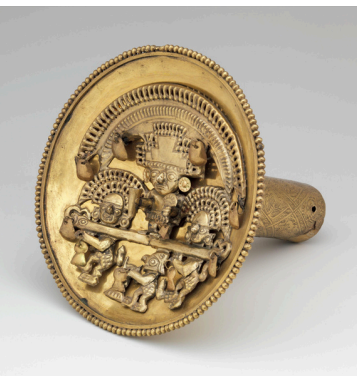
Chimú. Earflare with ritual procession. 1350–1470 CE. The Metropolitan Museum of Art.

“I’m planning to have students create their own folders as part of assignments. Imagine asking them to curate three articles and three images on a topic they care about—it’s a way to teach research and interpretation together.”