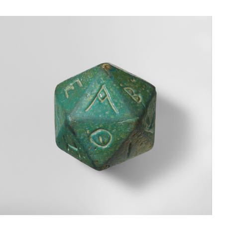
Roman. Faience polyhedron inscribed with letters of the Greek alphabet. Faience. ca. 2–3 CE. Part of Open: The Metropolitan Museum of Art

"For most international students, this is like performing a mental somersault for every research paper they write...Since research is fundamentally about communication, every international student should take advantage of AI tools."