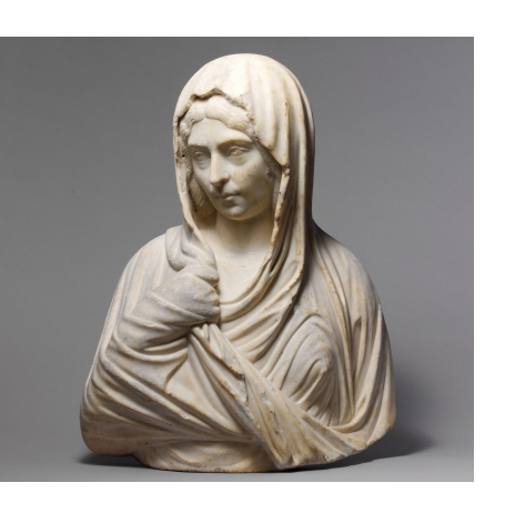
Roman. Marble portrait bust of a woman. Marble. ca. 193-211 CE.

responsibilities include managing library resources and supporting student and faculty research. This means ensuring access and promoting resources that offer key benefits to Denison's unique student and faculty populations. Effective resource management means having a strong grasp on the university community's needs, keeping in mind the nature of the student population and the manner of their research.