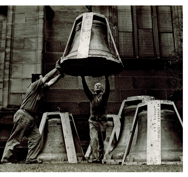
Workmen hoisting bells of St Andrew's Cathedral. Photograph. 1965. Part of St Andrew's Cathedral

"JSTOR is a trusted academic resource, easy and very intuitive to use. Google searches yield JSTOR results...the more routes we have to content in our collections the better. It's a great opportunity to harness information and synergies across a disparate range of sources, collections and institutions."