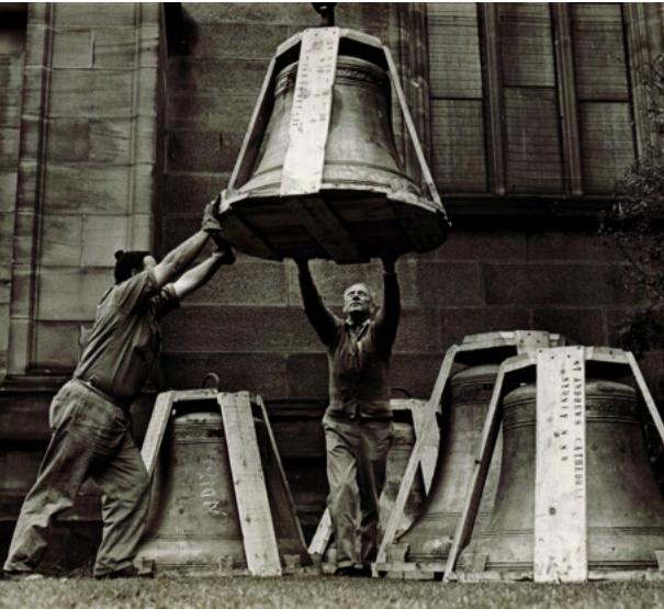
Workmen hoisting bells of St Andrew's Cathedral. Photograph. 1965. Part of St Andrew's Cathedral

“JSTOR is a trusted academic resource, easy and very intuitive to use. Google searches yield JSTOR results...the more routes we have to content in our collections the better. It’s a great opportunity to harness information and synergies across a disparate range of sources, collections and institutions.”