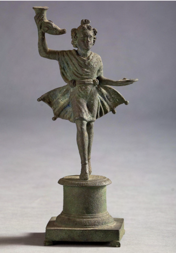
Roman. Dancing Lar. Bronze sculpture. 1st century CE. Part of Smith College: Van Buren Antiquities Collection